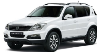
Rexton W Multi Link