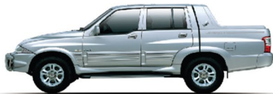
Musso MUSSO sports