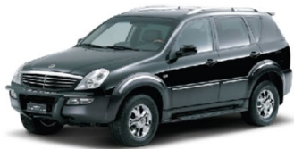
Rexton New Rexton