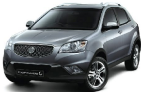
Korando New Korando