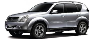
Rexton II Multi Link