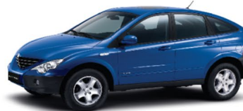
Actyon Actyon sports