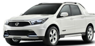
New Actyon Sports